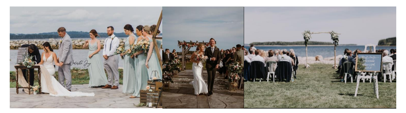
Natasha Joy Photography Jessie Snair Photography Tanya Canem Photography

Should you choose to hold your ceremony on the lawn in front of the chalets, you must book the 4 chalets located immediately behind the ceremony location in your wedding accommodation block. Ceremony set-up fees are included in the ballroom rental; this includes the set-up of chairs and your signing table. Should you require a more extensive set-up, a surcharge may apply.